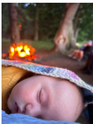
Our littlest camper... Ava Brookes, 7 weeks old.

It's always special to invest a new leader—but to be invested at family camp is extra special.