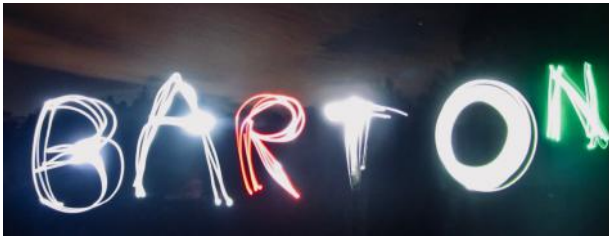
Photo gallery—no troop reports this half term, but we thought you would still like some photos.....