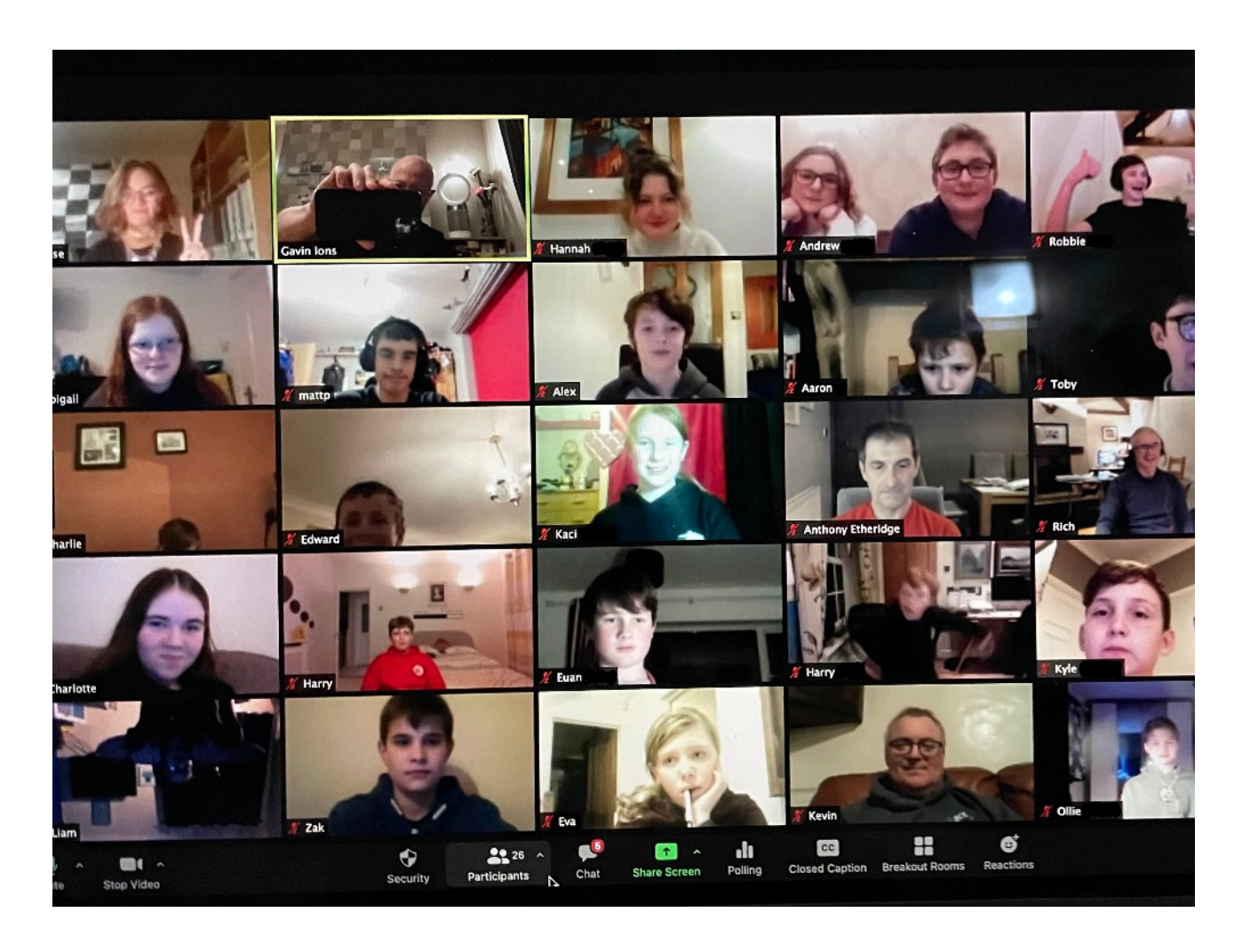
1st Barton Scout Group 2021 AGM Report